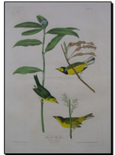
The Hooded Warbler Composite Plate, one of the 13 Composite Plates illustrated and explained in the book.

Note the addition of the immature Hooded Warbler in the lower right.